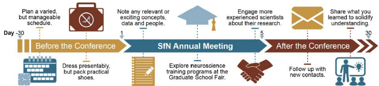
Figure 1. How to survive a large, international conference. Key advice for undergraduates before, during and after the SfN meeting. This two-month plan for the 5-day meeting aims to maximize a student's ability to meet and learn from colleagues.

ABSTRACT: The annual meeting of the Society for Neuroscience (SfN) attracts over 30,000 attendees, including many of the world's most accomplished researchers. Although it can be intimidating to attend a conference of this scale, there are many rewards for undergraduates. Based on surveys of young neuroscientists, we provide planning strategies to ensure attendees maximize their exposure and retention of the breadth and depth offered by this large conference format without becoming overwhelmed.